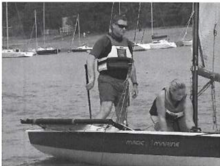
The Commodore is even allowed to sail.

We have made it a little easier for CDOs by attaching a small, but powerful, torch to the generator ignition keys, enabling easier and safer negotiation of the various obstacles to the rear of the Clubhouse, and by installing new metal roller shutters at each end of the Clubhouse, operated by an internal pull cord, to replace the old (and often difficult to close) sliding shutters.