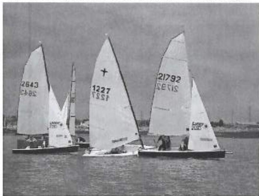
Medium Fleet Action