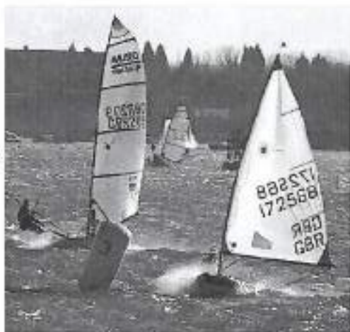
A look forward to next year's Hoo Freezer with a look back at this year's, which wind, temperature and course (only one gybe!) put just on the right side of the limit.

Or use 'the box at the top of the stairs'