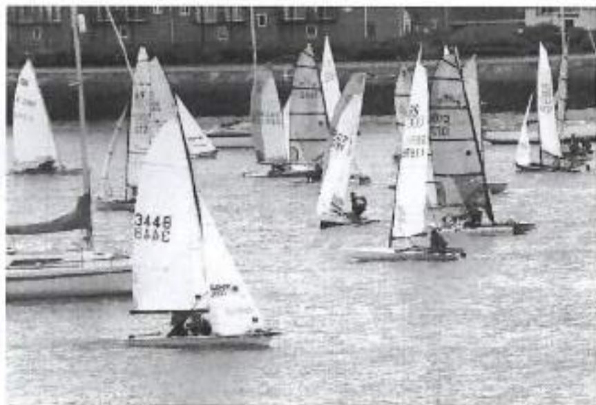
Pre-start milling on the Saturday afternoon